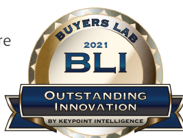
Xerox Adaptive CMYK+ Kits

Take automation to the extreme with click-simple automated colour quality with full spectrum colour management hardware and software tools. An inline X-Rite® Spectrophotometer with Colour Profiler Suite working with Automated Colour Quality Suite (ACQS) takes the variability out of the colour equation and reduces time-consuming manual colour maintenance and operator error.