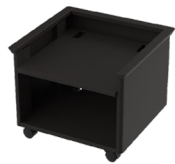
Adjustable Printer Stand